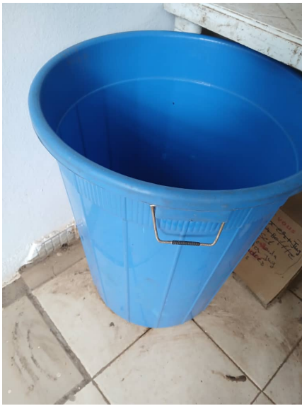
Plastic containers at Sl. No. 06 of Annexure 1