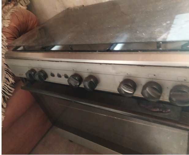
Cooking range at Sl. No. 02 of Annexure 1