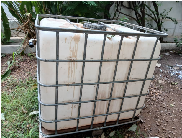
Water tank at Sl. No. 09 of Annexure 1