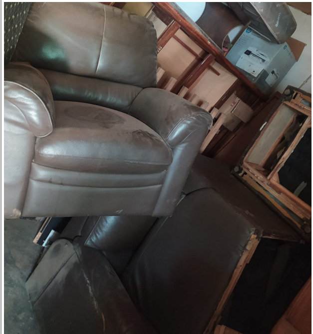
Sofa set at Sl. No. 10 of Annexure 1