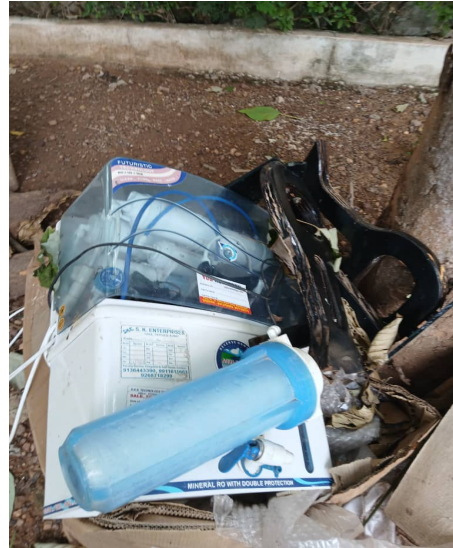
Water purifier & peg tables at Sl. No. 07 & 08 of Annexure 1