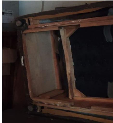
Dressing table at Sl. No. 03 of Annexure 1