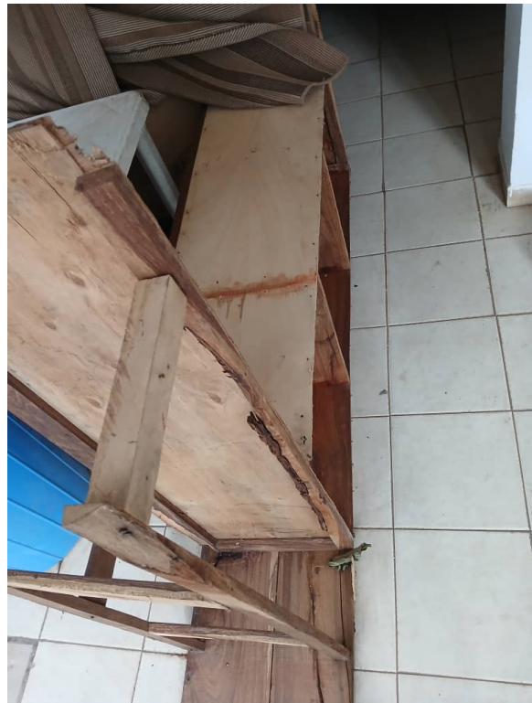
Almirah at Sl. No. 05 of Annexure 1