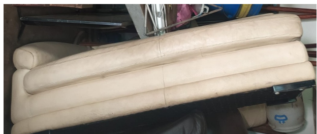
Sofa set at Sl. No. 01 of Annexure 1